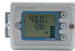
Digital Duct Humidistat