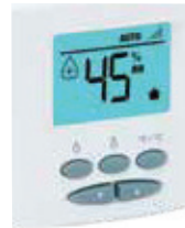
Digital Wall Humidistat